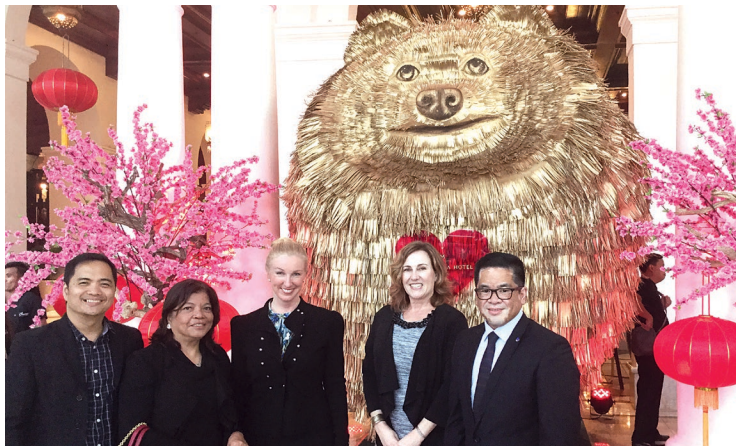
from page 1... PAMET Partners with ASCP

During the meeting, ASCP presented to PAMET, the various programs and opportunities it could offer to PAMET members through a collaboration. Among the matters covered were opportunities for international membership, continuing education and certification such as: