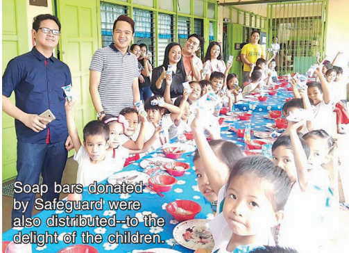
Soap bars donated by Safeguard were also distributed to the delight of the children.