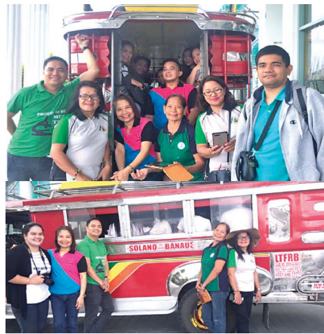
March 18, 2018 - Collaboration, PAMET Invitation Community Outreach Program organized by Intergrated Chapters of Isabela, Ifugao, Quirino and Nueva Vizcaya.