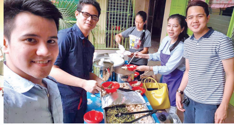
PAMET-OZ provided free nutritious lunch for undernourished pupils of the Old Cabalan Integrated School in Olongapo City; in cooperation with the Rotary Club of Downtown Olongapo and PMAP-Subic Chapter