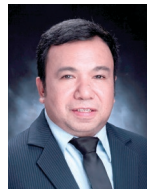
by Gamaliel A. Fulgueras

It provided the guidelines in making a plan to the committee chairs prior to the actual session which include the following: members of the committee, objectives, 2017 plans versus 2017 accomplishments, challenges, opportunities for improvement and learnings, 2018 plans and priorities, its strategies and timelines, recommendations/ outputs, budgetary and logistical requirements.